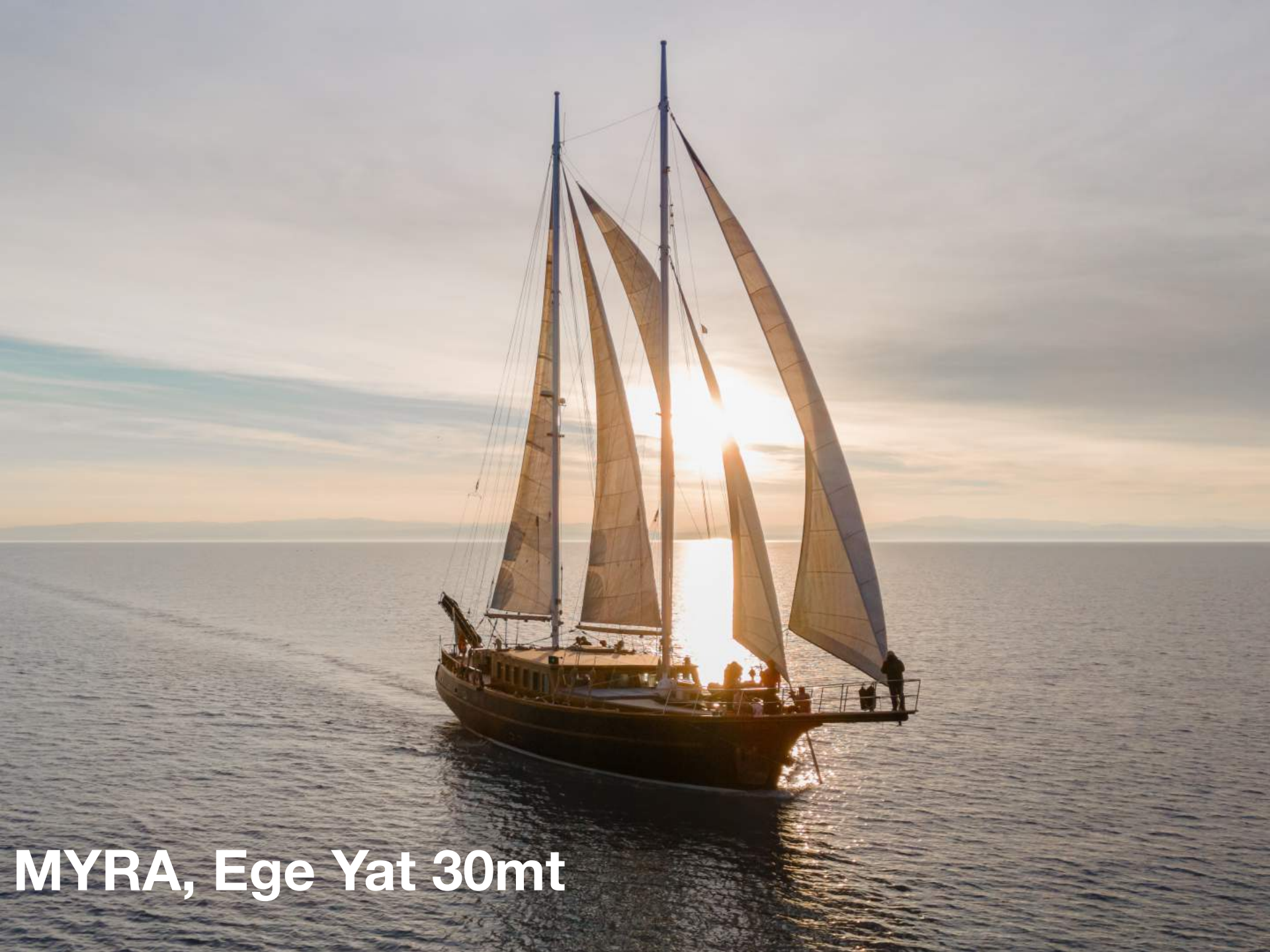
MYRA, Ege Yat 30mt